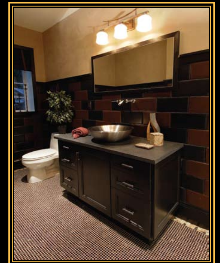
Lower Level Bathroom: Newport Black Mocha

The Lower Level Bathroom vanity is painted and hand glazed lending it a warm and dramatic effect.