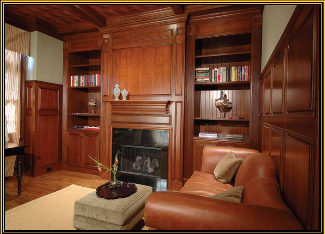
Study: Wainscoting in Chestnut on Cherry