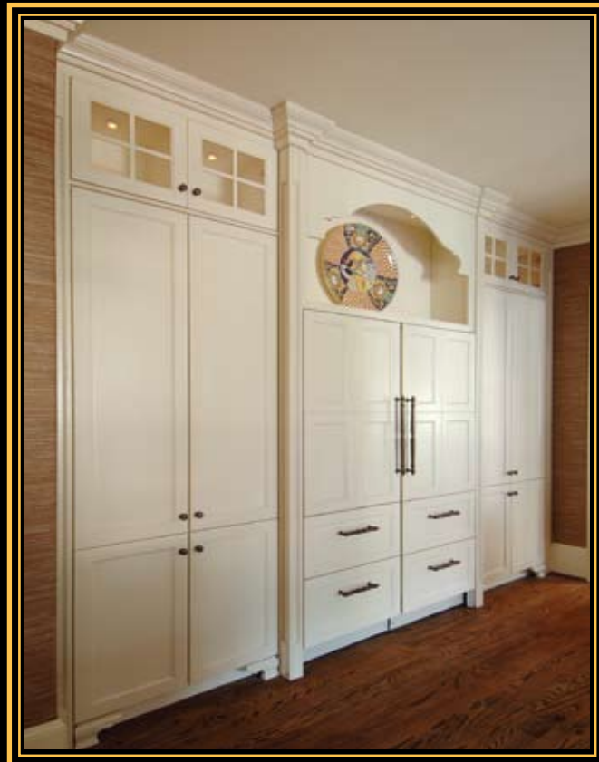
Sub-Zero Storage Center: Jamestown Vintage

Century Cabinetry has three manufacturing facilities located in Berks and Chester counties.