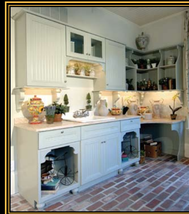
Sun Room: Nantucket Celery

Century Cabinetry is a proud sponsor of the Philadelphia Magazine Design Home 2006™ . We invite you to discover all of the possibilities that Century Cabinetry has to offer.