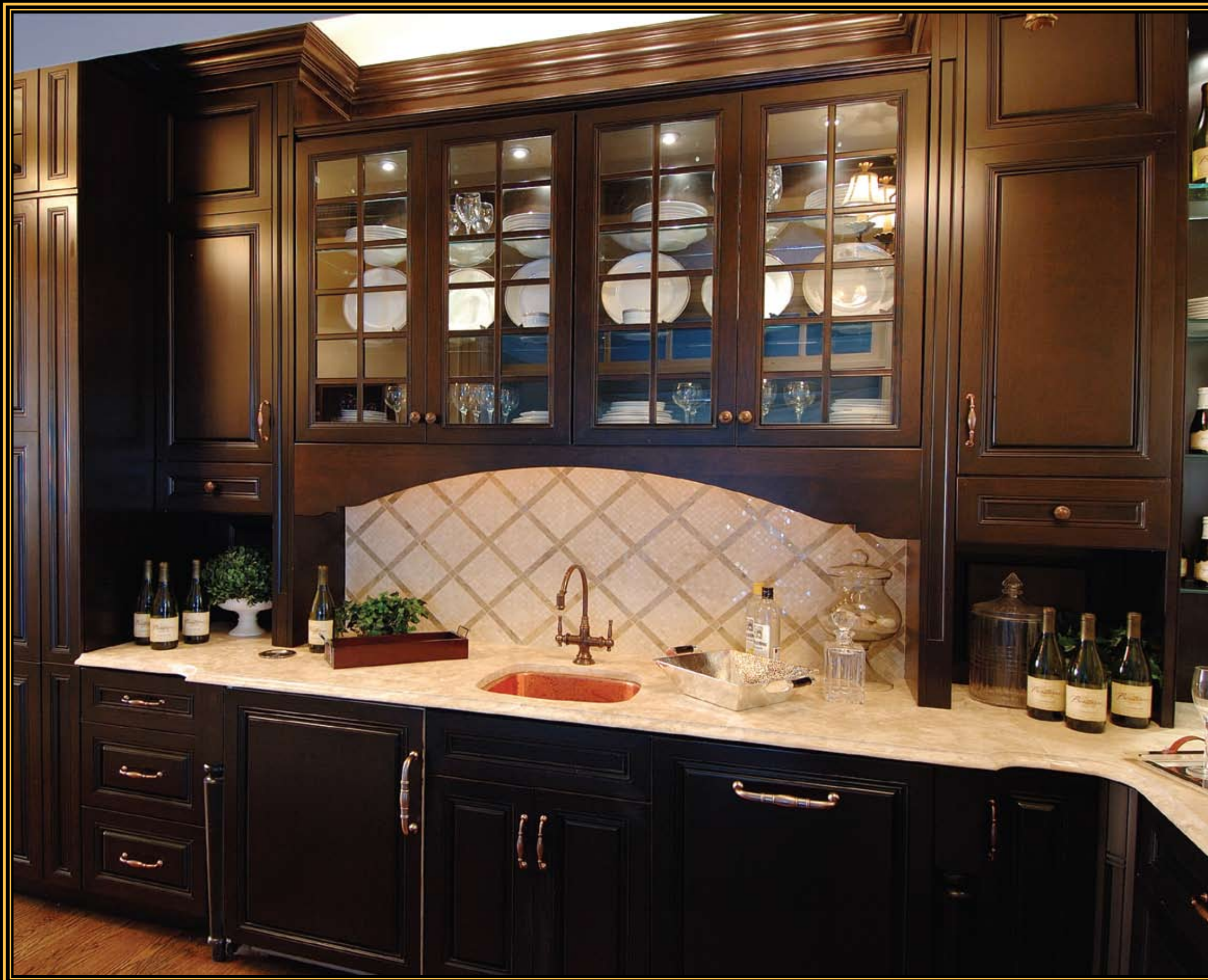
Butler's Pantry: Wentworth Espresso on Cherry