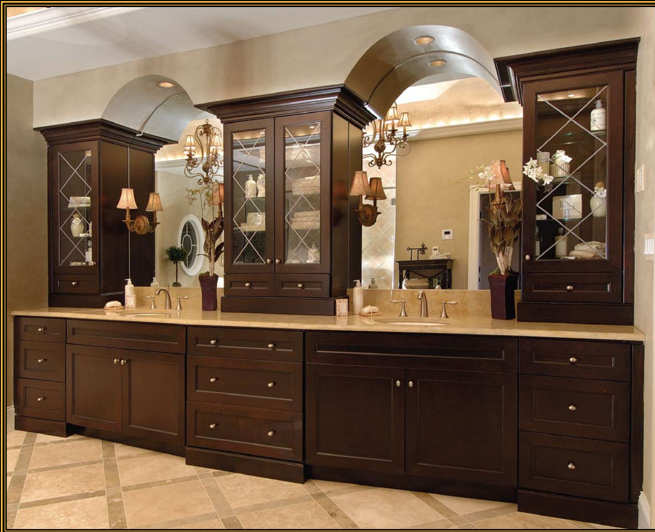
Master Bathroom: Jamestown Espresso on Cherry

The Master Bathroom cabinetry illuminates the room with its deep rich finish. His-and-her vanities reflect an exquisite sense of design, balance and symmetry.