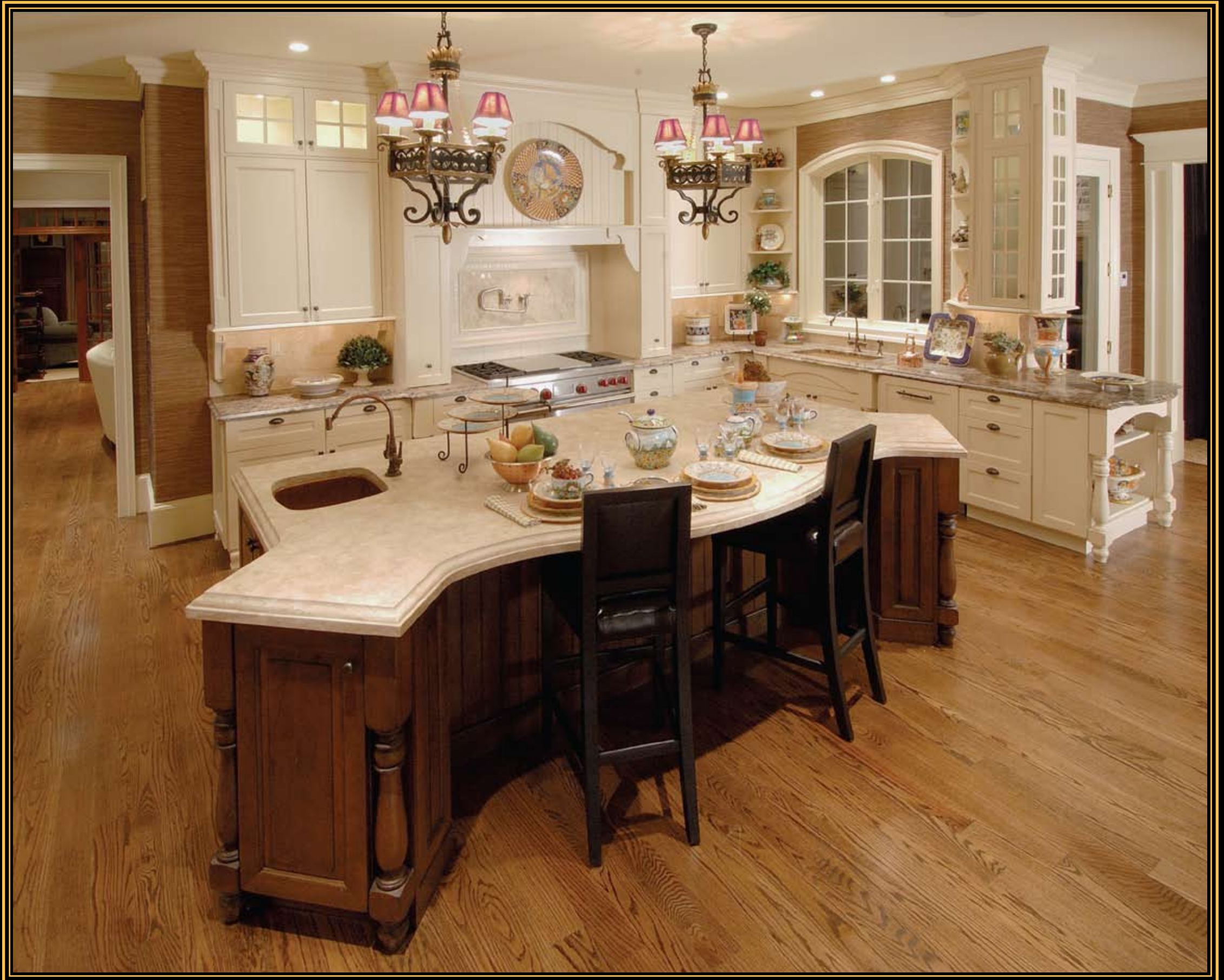
Kitchen: Jamestown Vintage , Island Charlestown Distressed Cherry